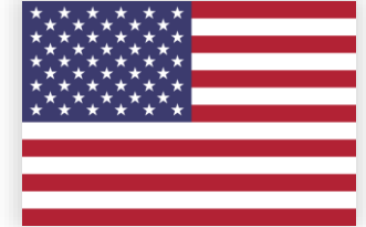
U.S. Federal Law Negotiations