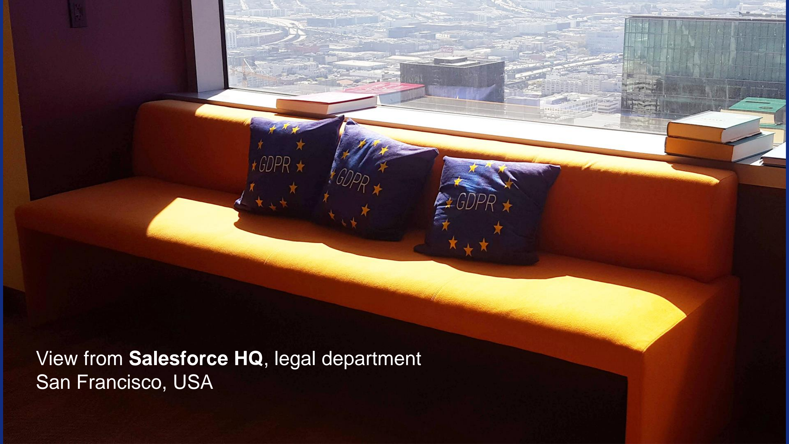
View from Salesforce HQ , legal department San Francisco, USA