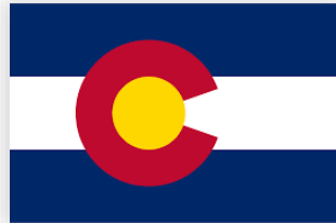
Colorado Data Privacy Act September 2018