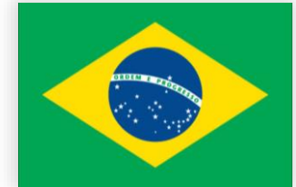
Brazil LGPD February 2020