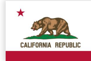
California Consumer Privacy Act January 2020