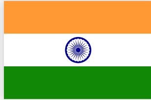
India Personal Data Protection Bill