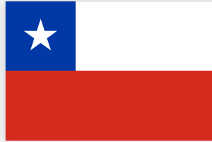
Chile Privacy Bill Initiative