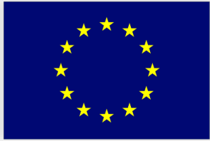
European Union ePrivacy