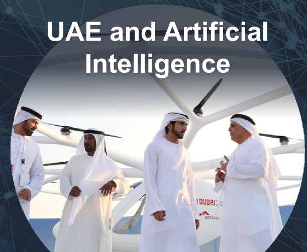
UAE and Artificial Intelligence