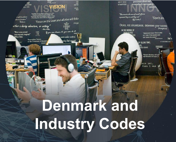
Denmark and Industry Codes