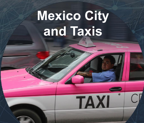
Mexico City and Taxis