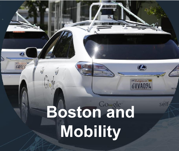
Boston and Mobility